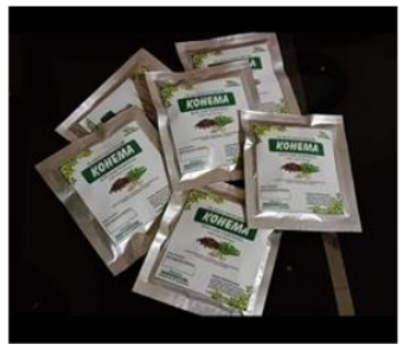
Figure 2. Packaging for Maronggi Ginger Coffee Product in Sachet packaging (One Drink) 20 Gr