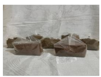
Figure 1. Maronggih Ginger Powder Product Plastic Packaging 250 Gr

Partners are starting to understand the importance of brand awareness or awareness of the importance of the brand of the product they are making. This can be seen from the start of partners selling products without attractive packaging and labels. Then partners create attractive packaging and product labels. The following is an overview of the partner's initial product until it becomes a product with packaging.